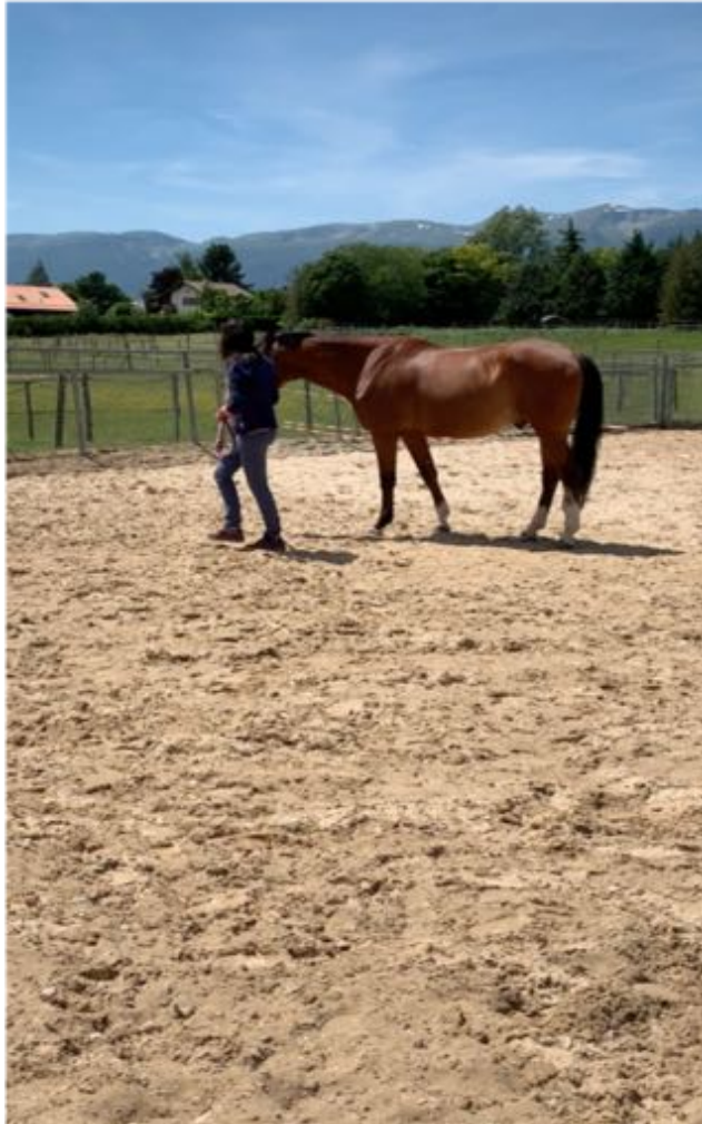
1-Guiding close range