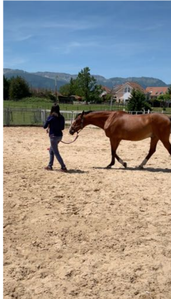
2-Guiding long range